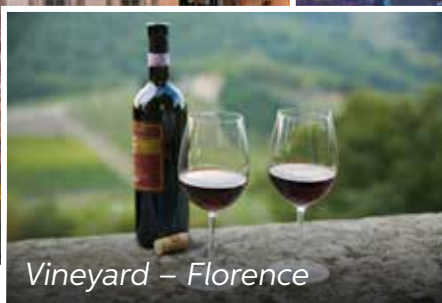
Vineyard – Florence

W e're excited to share some of the highlights of your dream vacation to Italy! You'll indulge in the rich culture, history, and iconic art and architecture in Rome and Florence. Authentic Italian cuisine offers an abundance of locally sourced fresh ingredients that, when paired with the perfect glass of Italian wine, will ignite your palate.