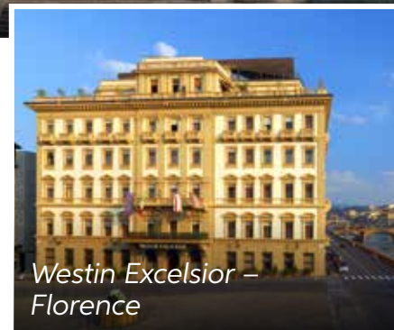
Westin Excelsior – Florence

Our journey will also take you north to Florence, capital of Italy's Tuscany region. You will spend four nights at The Westin Excelsior, an iconic luxury experience on the banks of the Arno River. Located in the heart of Florentine culture, The Westin Excelsior is the perfect location to experience the vibrancy and life of this charming city by immersing yourself into the local culture. Florence is a city that expresses itself through its architecture, landscape