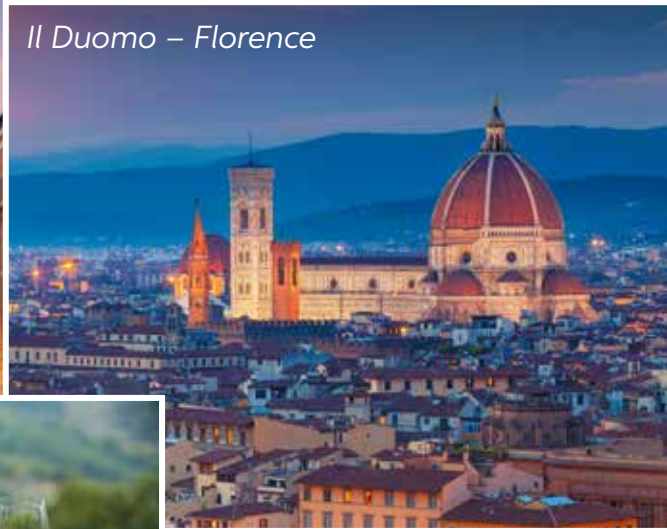
Il Duomo – Florence