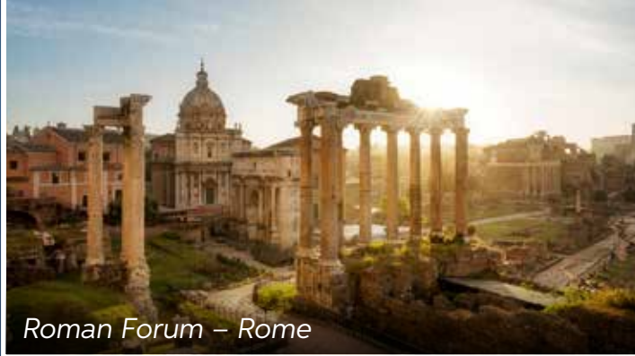
Roman Forum – Rome