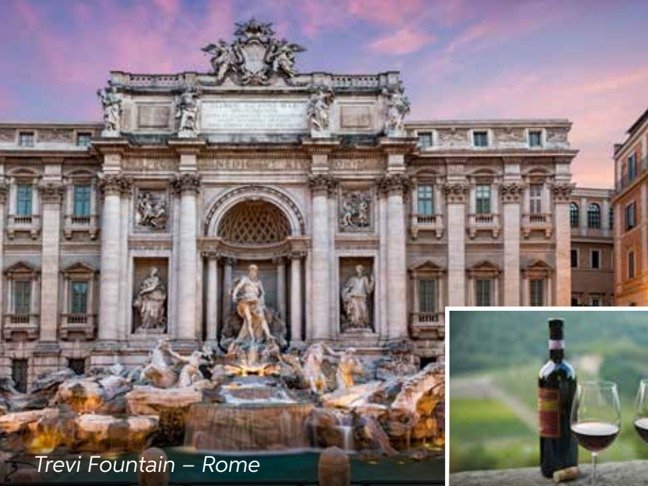
Trevi Fountain – Rome