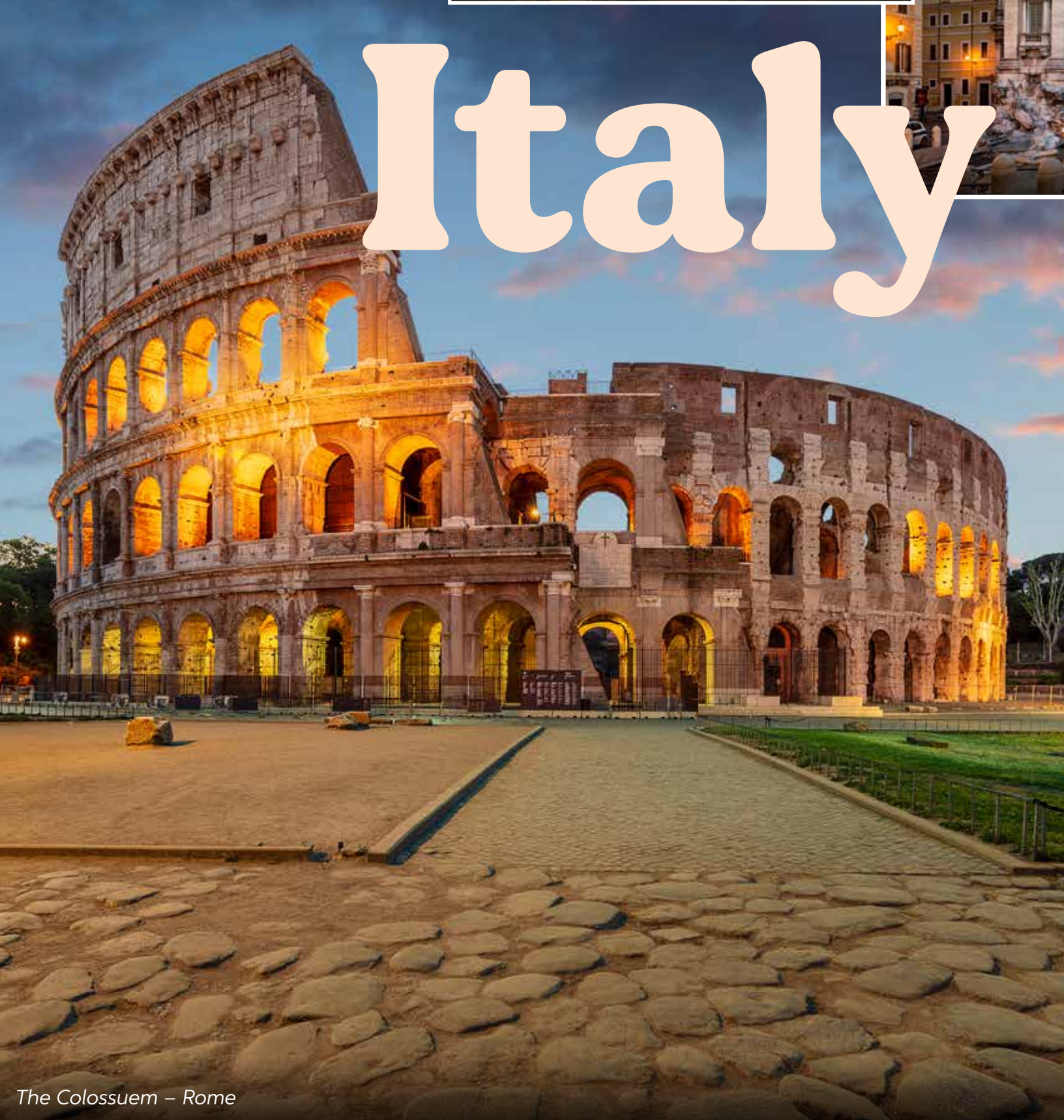
The Colosseum – Rome