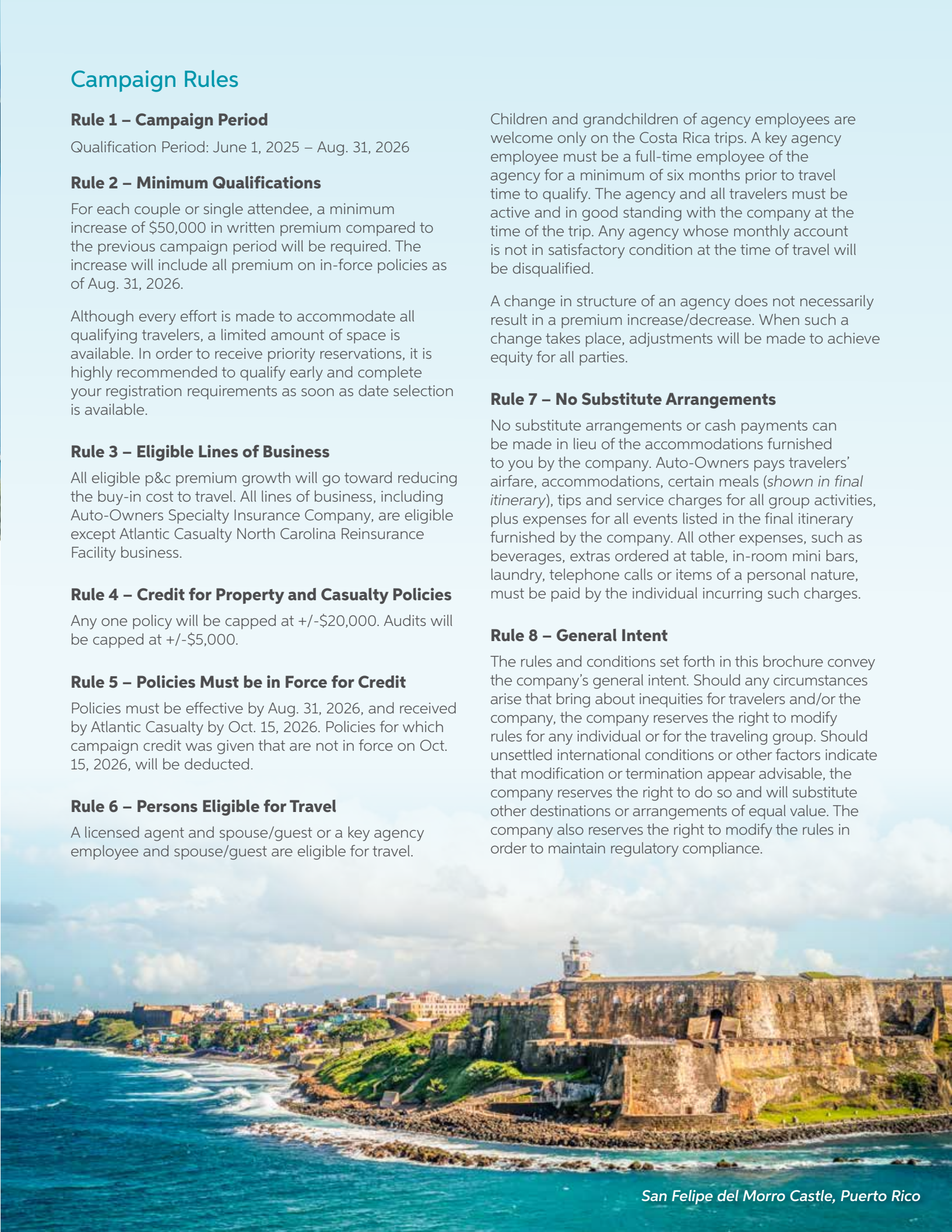
San Felipe del Morro Castle, Puerto Rico

The rules and conditions set forth in this brochure convey the company's general intent. Should any circumstances arise that bring about inequities for travelers and/or the company, the company reserves the right to modify rules for any individual or for the traveling group. Should unsettled international conditions or other factors indicate that modification or termination appear advisable, the company reserves the right to do so and will substitute other destinations or arrangements of equal value. The company also reserves the right to modify the rules in order to maintain regulatory compliance.