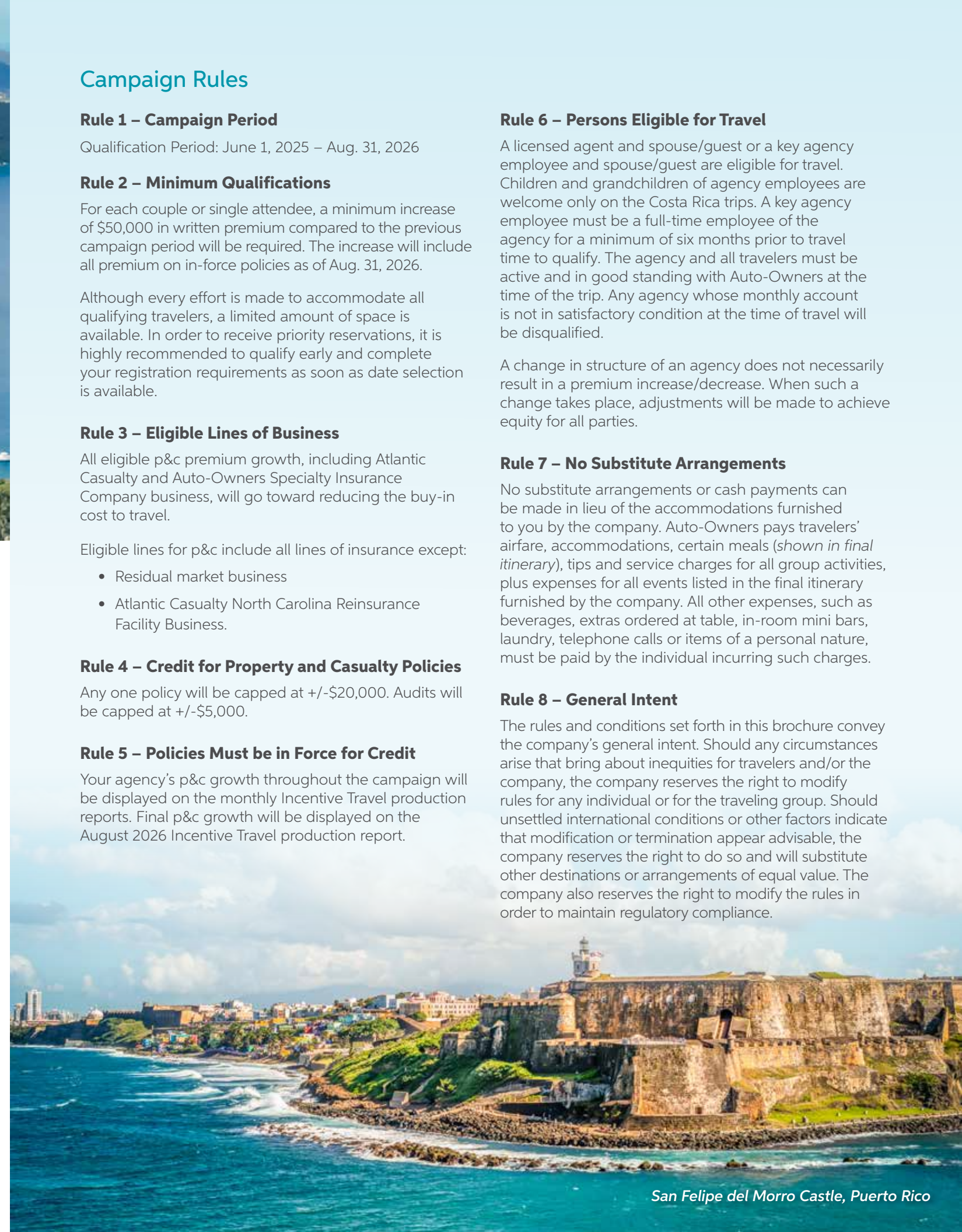
San Felipe del Morro Castle, Puerto Rico

The rules and conditions set forth in this brochure convey the company's general intent. Should any circumstances arise that bring about inequities for travelers and/or the company, the company reserves the right to modify rules for any individual or for the traveling group. Should unsettled international conditions or other factors indicate that modification or termination appear advisable, the company reserves the right to do so and will substitute other destinations or arrangements of equal value. The company also reserves the right to modify the rules in order to maintain regulatory compliance.